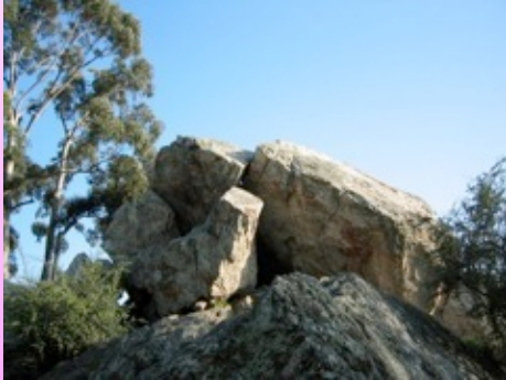
Indian Rock, Berkeley Hills

Surf the Outernet! • March, 2009 • rex@terraloco.com