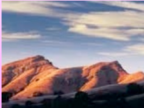
Maguire Peaks, Sunol

Surf the Outernet! • December, 2008 • rex@terraloco.com